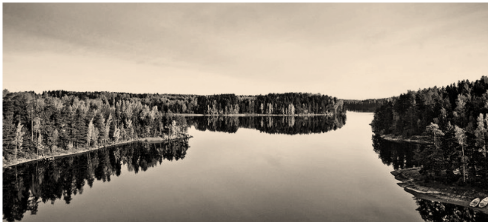
Lakeland in Southeastern Finland